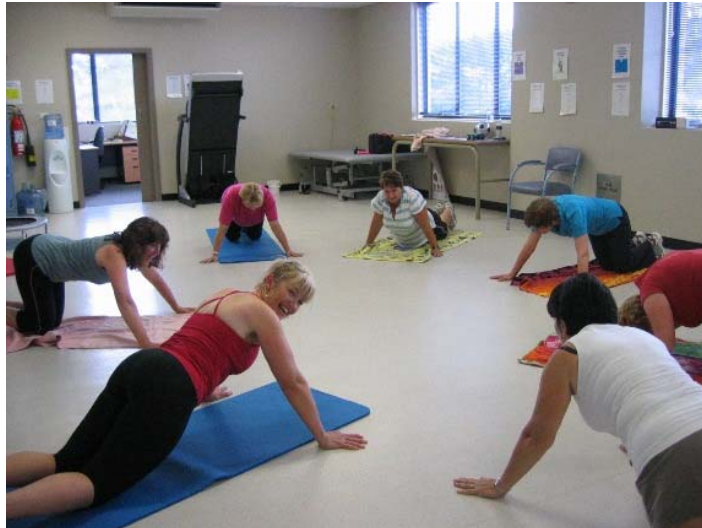
Photo: Participants get ready to tackle some push ups.