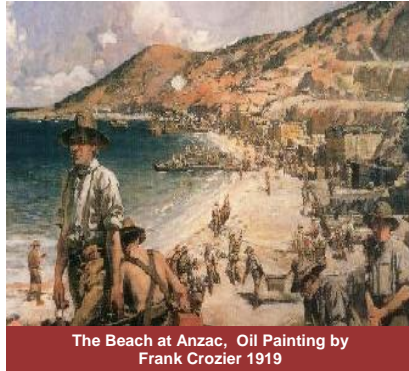
The Beach at Anzac, Oil Painting by Frank Crozier 1919

Anzac Day commemorates the landing of Australian and New Zealand troops at Gallipoli on 25 April 1915. The date, 25 April, was officially named ANZAC Day in 1916.