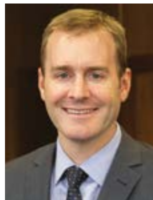
Hon Michael Ferguson MP Minister for Health