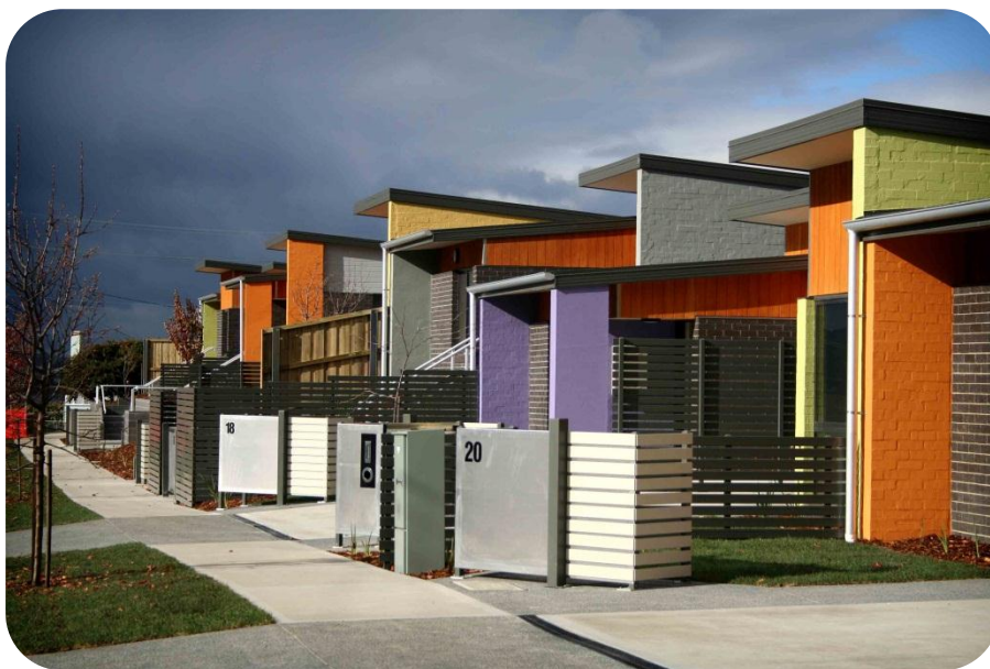
Maroni Close units, Southern Tasmania

Achievement of this goal would result in a reduction in the deferred maintenance liability and an improvement in the alignment of stock to need. We will do this through better planning, a new operational structure and accessing a sustainable funding source.