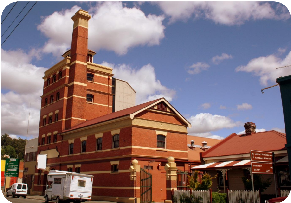
Thyne House, Supported Accommodation Facility, Northern Tasmania